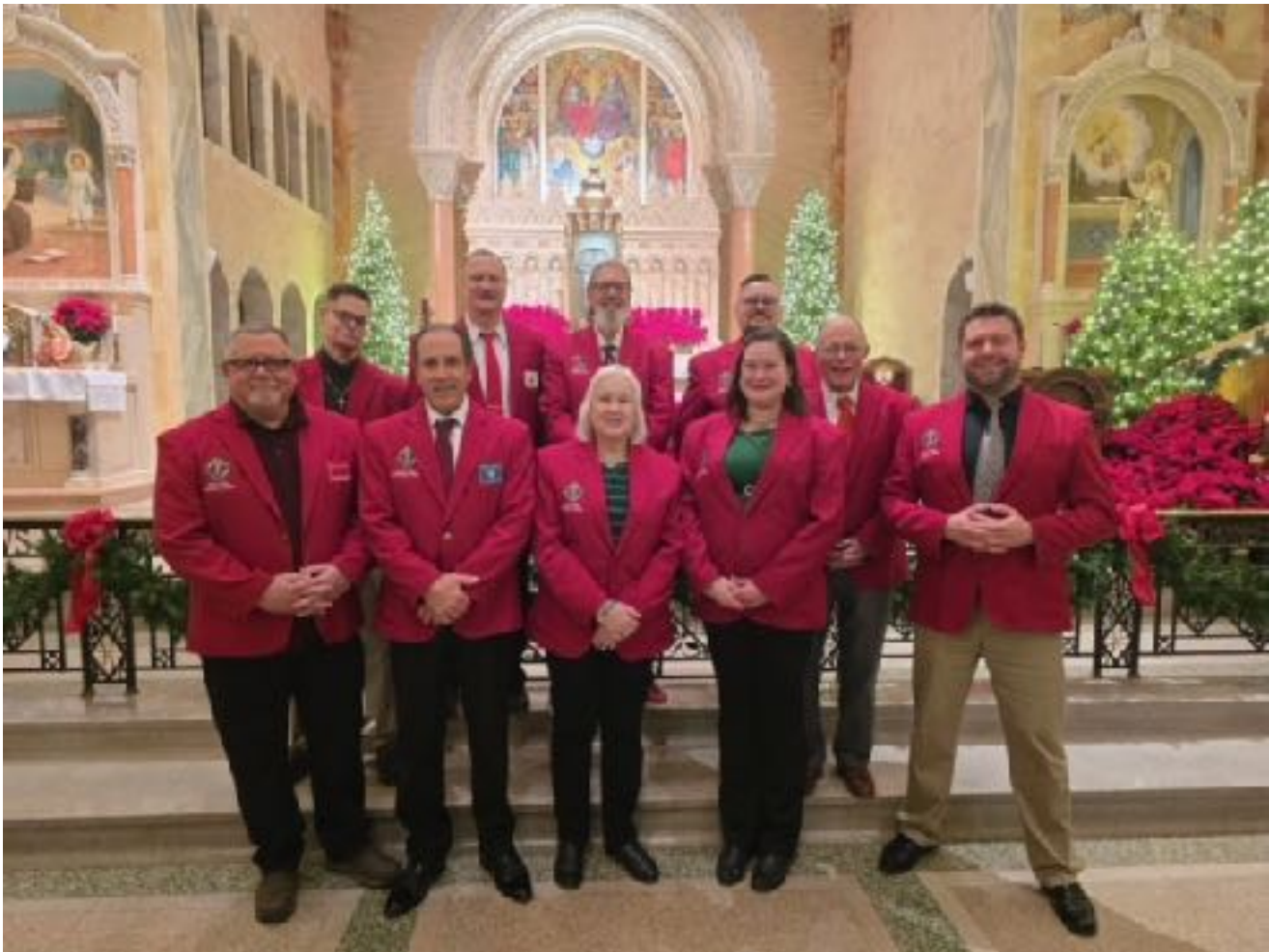
KofC 4240 at Holy Hill midnight Christmas Mass.